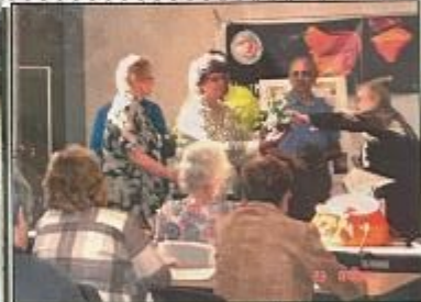
Butte's District Fall Meeting at Butte College