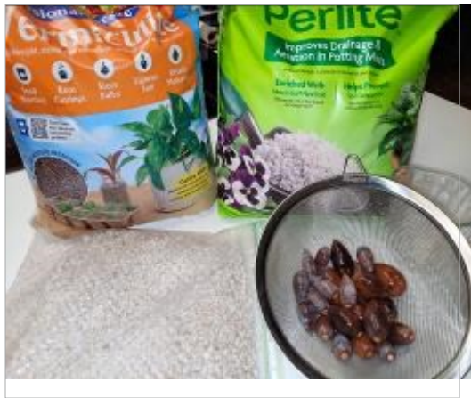
Blue oak acorns ready for stratification (another word for simulating over-wintering conditions).

Anywhere south of about Pearson Rd. you find the well-known "banana belt of Paradise." Drive down Skyway from Paradise and it's even more obvious due to the kinds of bigger native plants seen: foothill pines and especially those "wild" blue oaks. It's a biome that stretches from Pearson into Chico and in fact runs through most of the Central Valley, although supplanted by industry and agriculture in most places.