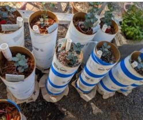
A snapshot of eight of the 12 blue oaks, ready for their forever homes.

In November 2022 I collected 21 freshly fallen blue oak acorns and stratified them (i.e., artificially "winterized" them in controlled conditions) for about four months. In the spring this group had about a 66% germination rate — not awful, but probably not great, either, given the stable conditions (and total absence of cattle and/or deer) inside my tent garden.