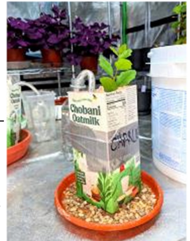
Blue oak seedling at one month.

It was the seminal moment in a new project: OK, so germination might not be the whole problem, but, hey. I'm a gardener. I can spend a little time on checking out how hard it is to propagate blue oaks in captive conditions, as it were.